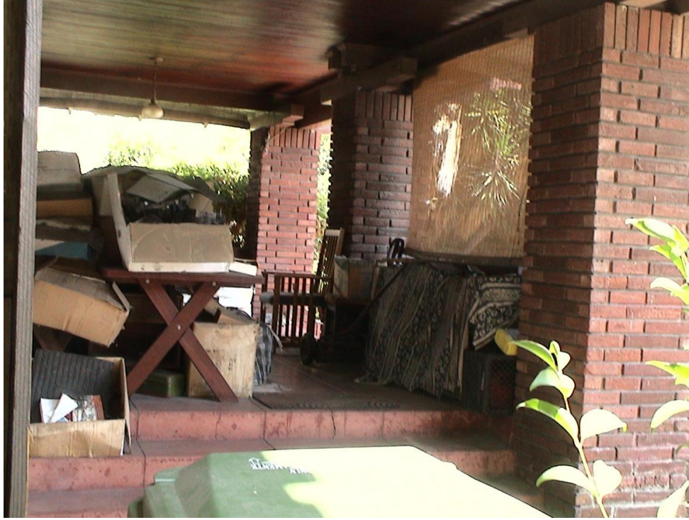
A picture is worth a thousand words. This is the front porch of the residence.