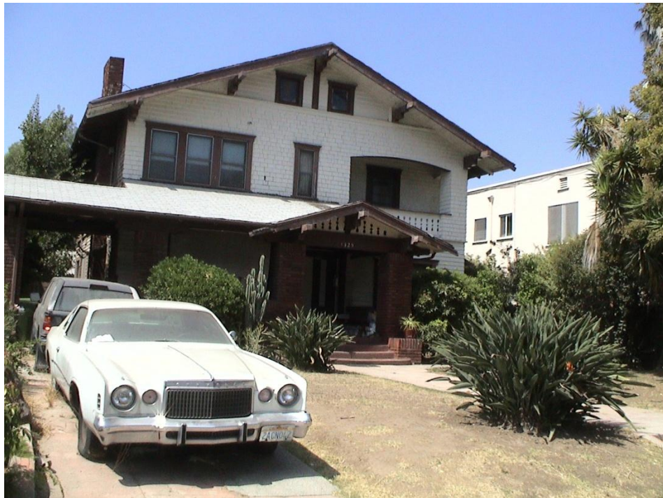
Inoperable vehicles parked in the driveway facing the street for a year or more.